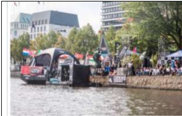
Binnentalster Hamburg Town Centre Deep: ca. 2.50m