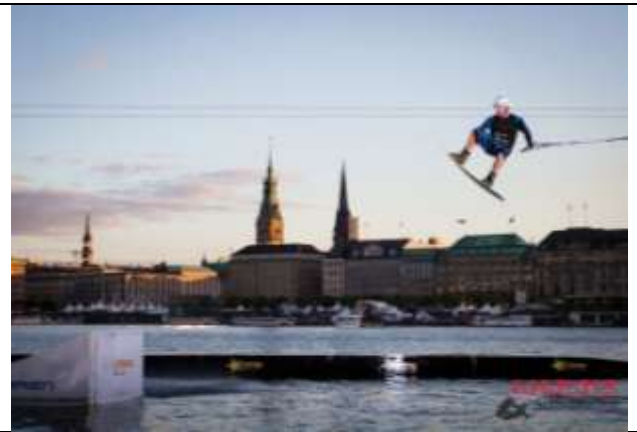
Sesitec System 2.0 Standard Setup with mast height 8 Meter

Since 1976 the „Alstervergnügen“ takes place annually: More than 600.000 spectators promenade across the “Binnentalster”. Since 2010 the Wake-Masters have pioneered this unique location for wakeboarding and offerered in 2014 for the first time an international competition wich will be continued in 2015.