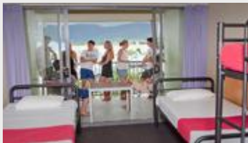
4 Bed Dorm

These are hotel style rooms with your own private balcony, fridge, TV, hair-dryer. Great for small groups travelling together or a way to pamper yourself and avoid big crowds. Luxury at an affordable price.