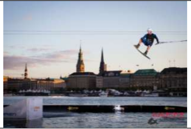
Sesitec System 2.0 Standard Setup with mast height 8 Meter

Since 1976 the "Alstervergnügen" takes place annually: More than 600.000 spectators promenade across the "Binnenalster". Since 2010 the Wake-Masters have pioneered this unique location for wakeboarding and offererd in 2014 for the first time an international competition wich will be continued in 2015.